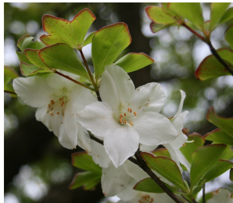
R. quinquefolium