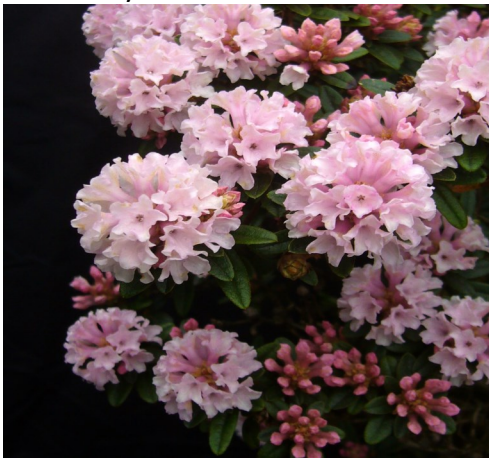
R. trichostomum

The fall season changes add more to the genus rhododendron's value in our gardens.