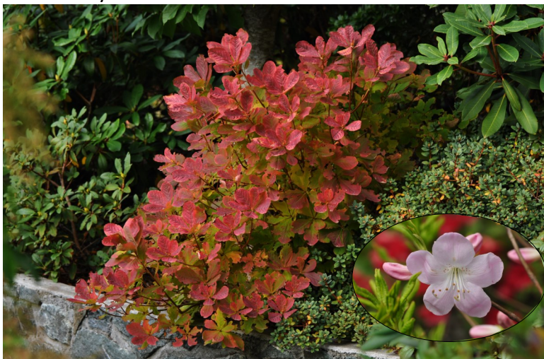
R. schlippenbachii