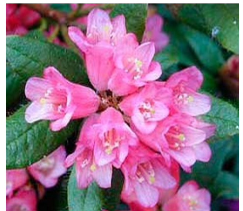
R. 'Razorbill'