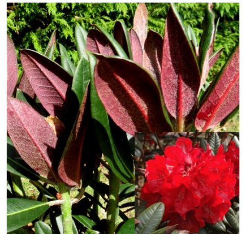
R. Cherries and Merlot by Phoenix Perennials and Specialty Plants